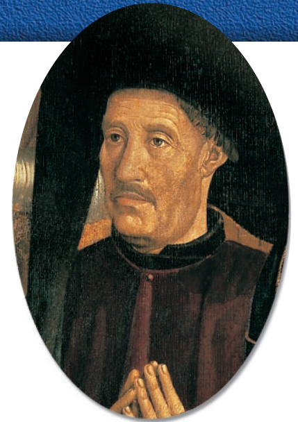
Henry the Navigator sponsored voyages that helped Portugal find a water route to Asia.

Henry decided to organize and pay for sailing expeditions to explore the Atlantic and the west coast of Africa. He was hoping to find African gold, to learn more about geography, and to spread Christianity. His ships traveled farther down the African coast than Europeans had ever gone. Because Henry sponsored the voyages, the English named him "the navigator." Those voyages began Europe's age of discovery. As you will read in this section, this age of discovery eventually led Europeans to the Americas.