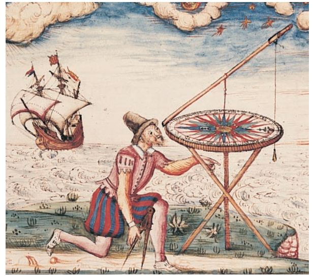
A French map-maker uses an instrument to learn his exact position on the globe.

For centuries, Europeans had seen the ocean as a barrier. With one voyage, Columbus changed that. Instead of a barrier, the Atlantic Ocean became a bridge that connected Europe, Africa, and the Americas. As you will learn in Chapter 2, Columbus's explorations began an era of great wealth and power for Spain. As Spain grew rich, England, France, and other European countries also began to send ships to the Americas.