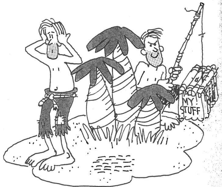
Why did Locke believe it was necessary for people to create governments?