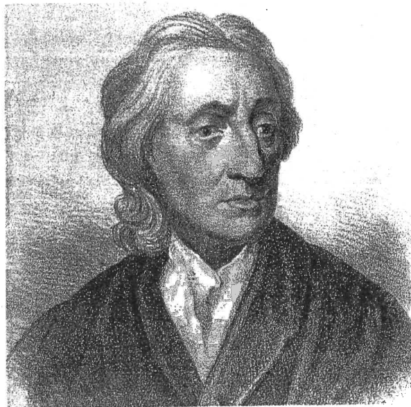
John Locke (1632–1704) In what ways did Locke's ideas influence the Founders?