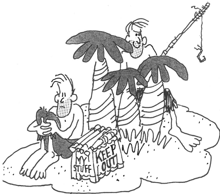
According to Locke, how is personal property protected in a state of nature?

Locke believed that most people understood this law of nature through the use of their reason and followed it because their consciences obliged them to do so. Not all humans were reasonable or good, however. There might even be disagreement about what the “laws of nature” were. If there were no government, there would be no one with the right to interpret or enforce these laws.